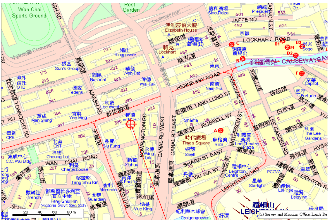
E-Tech Centre (智德中心)